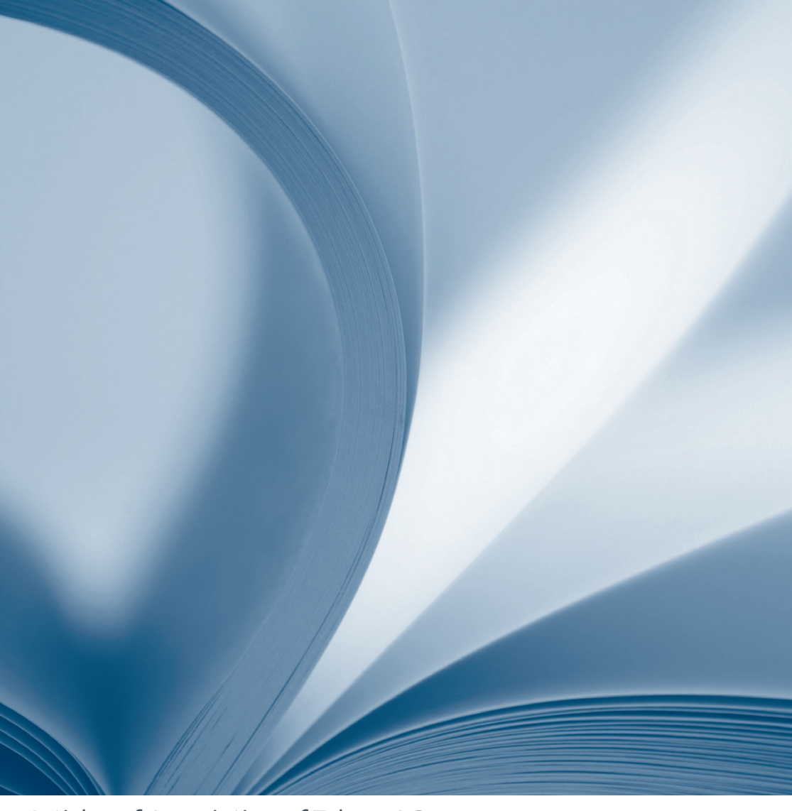
Articles of Association of Talanx AG